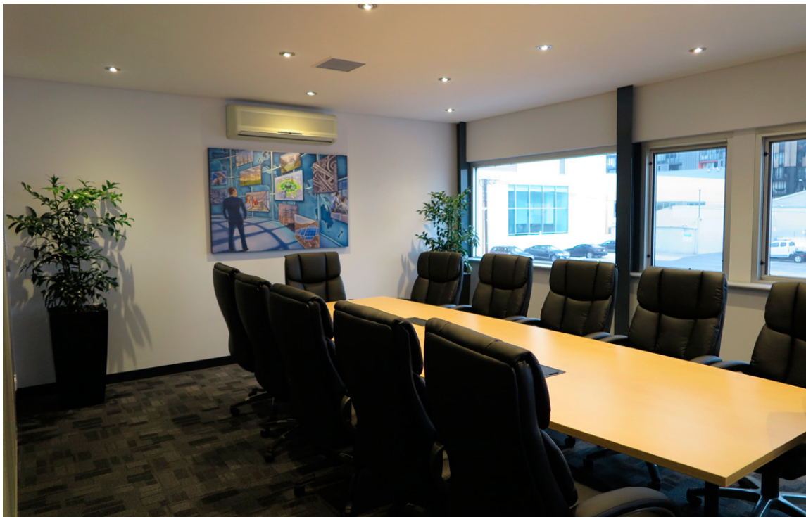
PSC Adelaide Conference Room

To meet the growing work load in South Australia, PSC has moved to a new office at 4 Moger Lane in Adelaide. The new office can comfortably accommodate all permanent and visiting PSC staff and has a large conference room suitable for hosting training courses. A successful social function for staff and clients to celebrate the office opening was held on the 4th August.